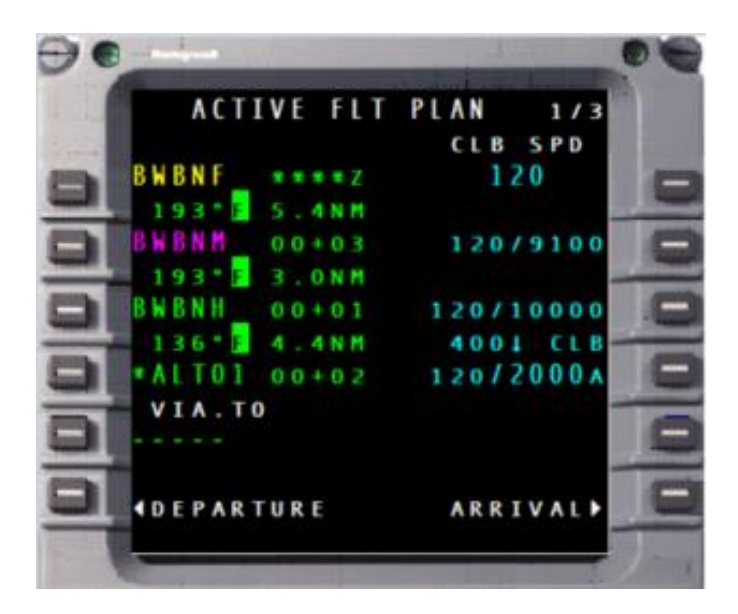
Figure 4. Incorrect Course on Altitude leg after the Missed Approach activation