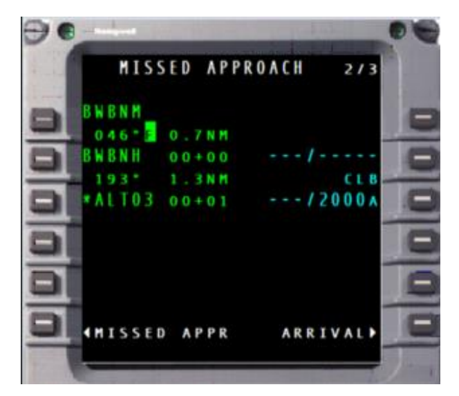
Figure 2. Incorrect Course to BWBNH

(2) Incorrect courses are displayed on the multifunction control display unit/control display unit (MCDU/CDU) (refer Figure 2 and Figure 4) and on the multifunction display (MFD) (refer Figure 3).