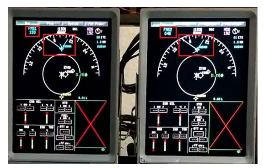
Figure 3. Incorrect Courses after the Missed Approach Activation